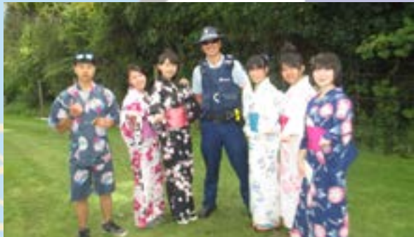
Above: Hakuba students pose for a photo with a local police officer at the Marlborough Multicultural Festival

They also attended the Havelock Mussel Festival, where they handed out information about the Nagano Prefecture as well as enjoying trying some of our local food delicacies. They all had a very enjoyable time and we hope that this will be a yearly visit.